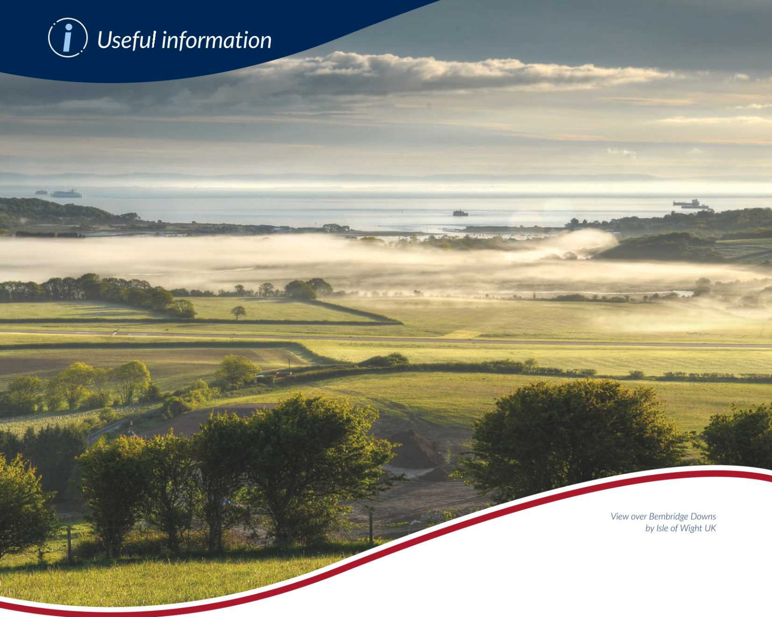
View over Bembridge Downs by Isle of Wight UK