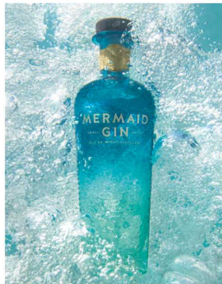
Isle of Wight Distillery, home of Mermaid Gin