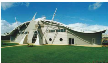
Dinosaur Isle, Sandown