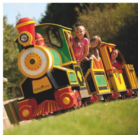
Robin Hill, Arreton