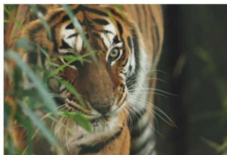
Wildheart Animal Sanctuary, Sandown